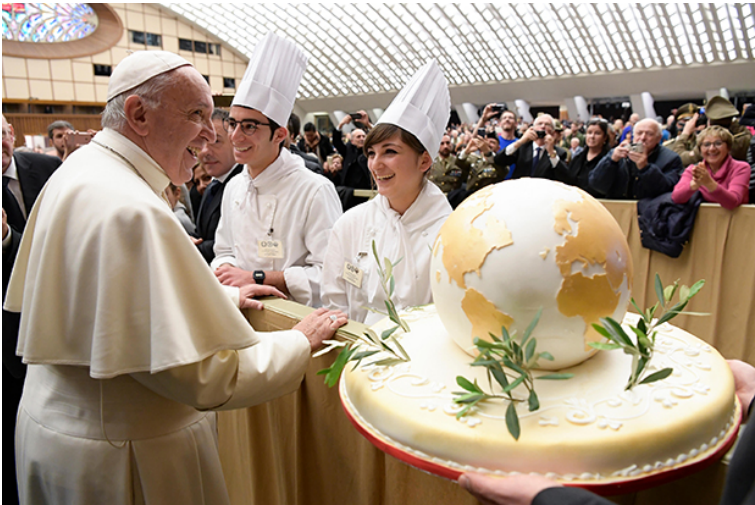
Francis receives a cake of the world with olive branches for his 80th birthday, Dec. 2016. 15 It is reminiscent of UN logo. By chance? No.

Jesuit European Social Centre reported that “Between 6 to 17 November, over 30 Jesuits and partners will hold events during the UN COP23 climate change conference in Bonn, Germany. The inspiration for Ecojesuit’s presence at COP23 is Pope Francis’ call in Laudato Si’ for ‘a new and universal solidarity.’” 14